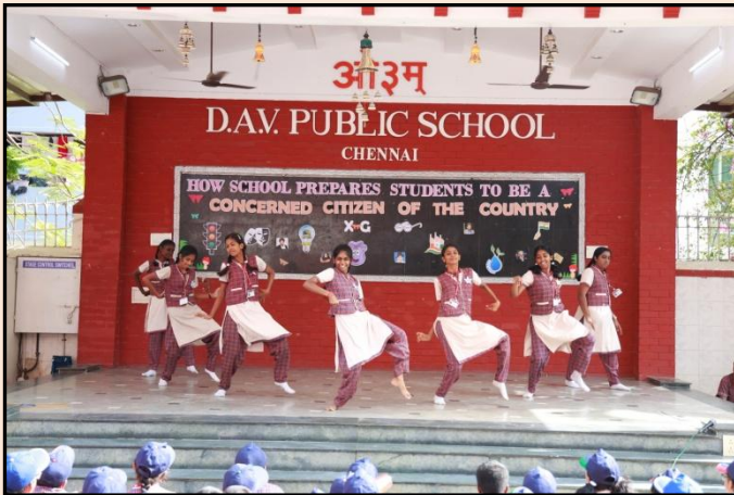
Realm of Music and Motion