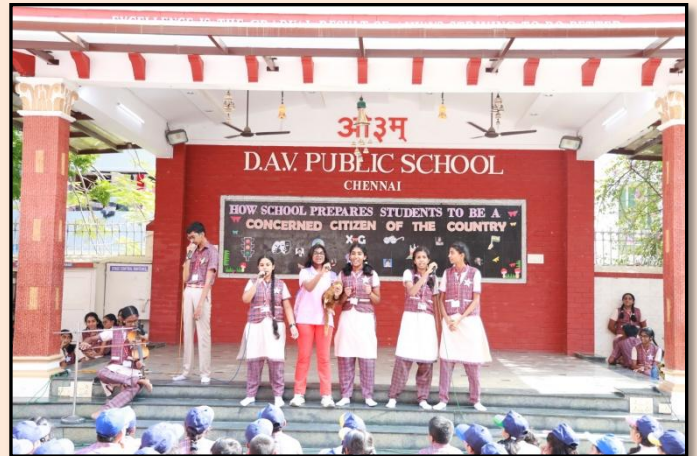
Rhythm of Life