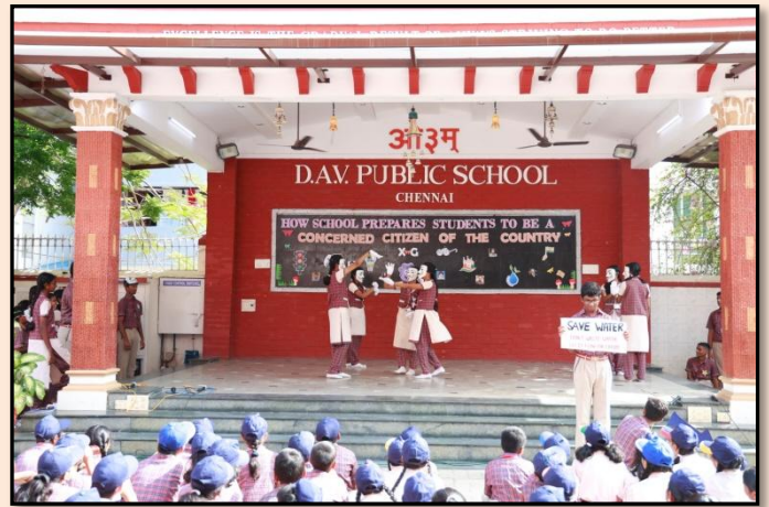
Display of Artistry and Expressions