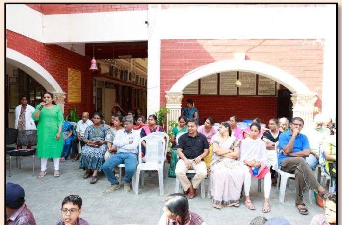
Parents Feedback on the Performance of their Ward and Assembly in General