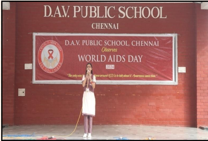
An Articulation on Sensitising the Crucial role of AIDS Day Observance