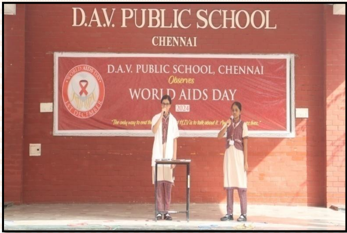
The Dual Act - "Laughing in the face of AIDS: Awareness, Action and