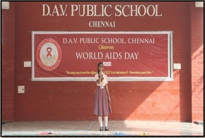
Introducing the Theme - "Take the Right Path: My Health, My Right"