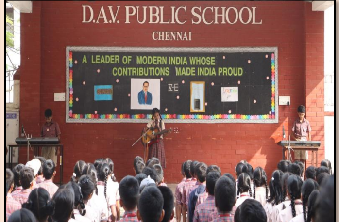
Instrumental Rendition of National Anthem