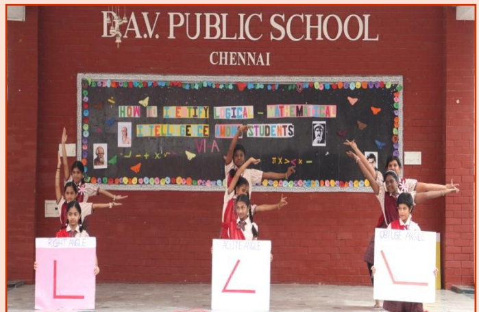
Enchanting Elegance – Presenting angles and Lines through Dance Poses