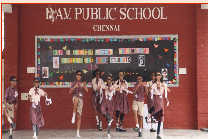
Graceful Grooves – Energetic Western Dance Performance