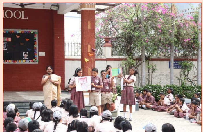
Words of Appreciation from our Beloved Principal Ma'am