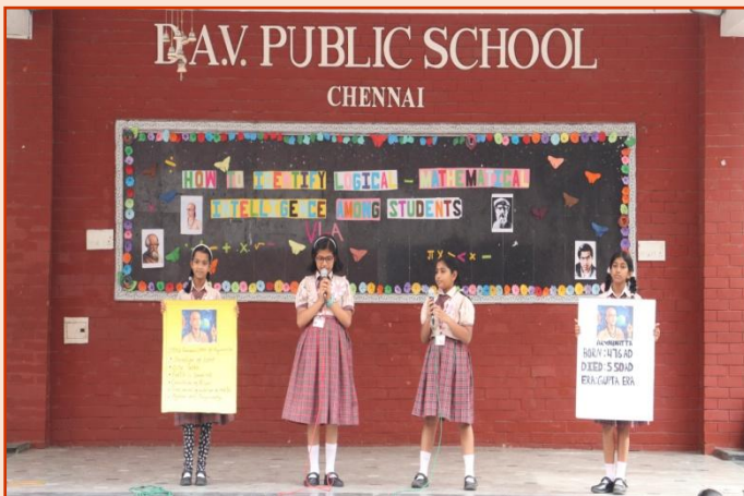
Aryabhata the Genius – Discussing the Contributions of Aryabhata