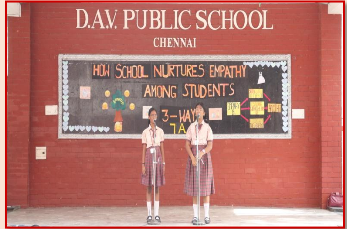
Mesmerising Musical Rendition