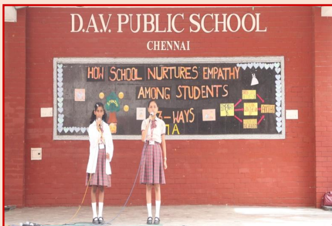
Talk Turkey with an Expert