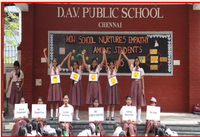
The Magical Emotions to Showcase Empathy