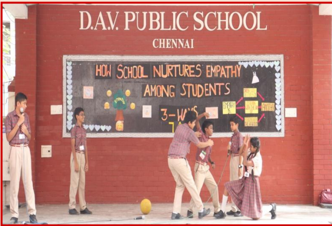
A Glimpse of the Web series 'The Echoes of Empathy'