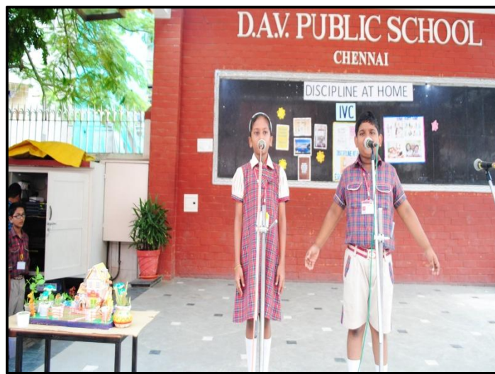
Discussion on 'An Ideal Home'