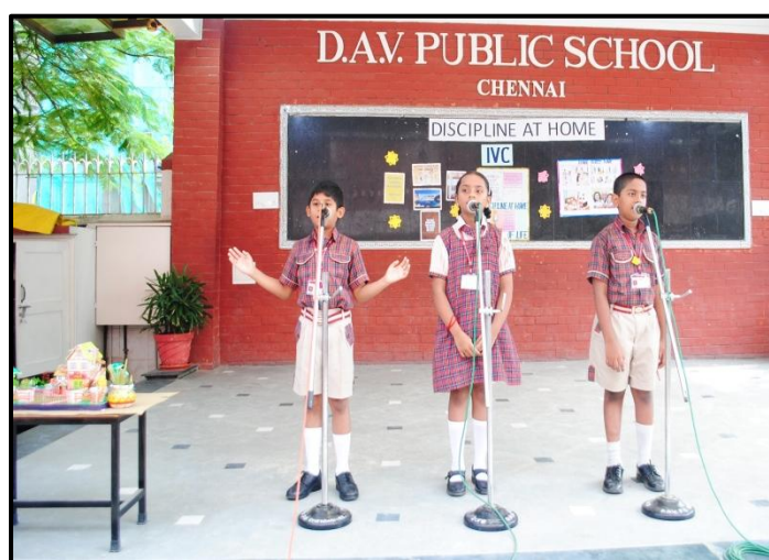
Story Telling – 'Value Enlightenment'