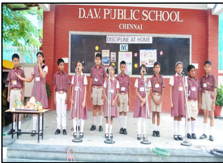
Prayer for Prosperity