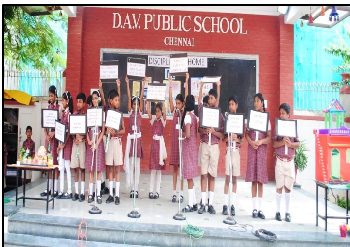
Virtues to be followed