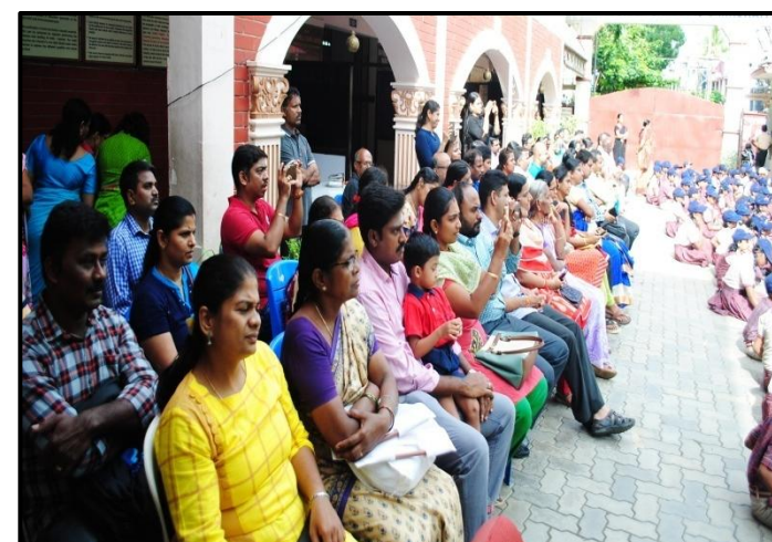
Parents deeply engrossed in the Class Assembly