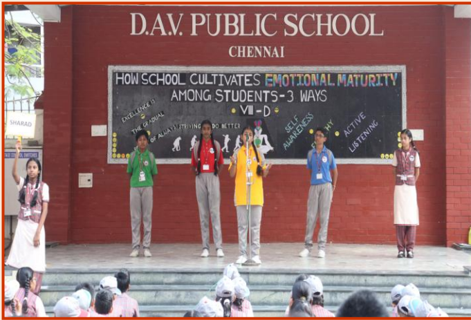
Wednesday Wonders – Decoding the Dress Code