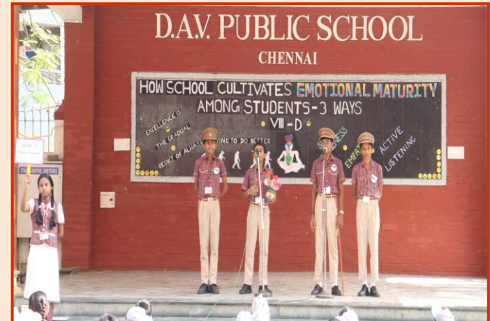
A Pot of Treasure – Skit by DAV Theatre Personalities