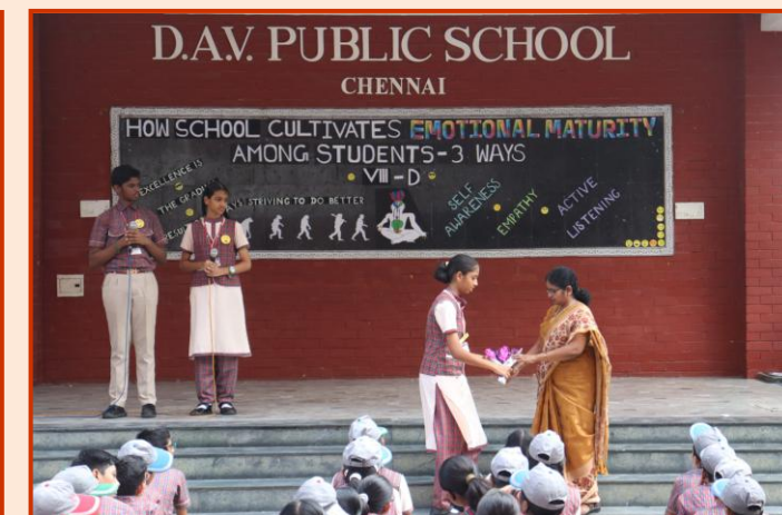
Felicitating Our Principal with an Origami Bouquet