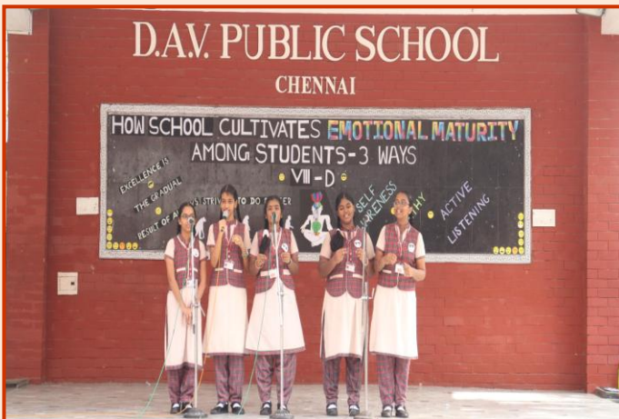
A Cappella on Emotions – Nightingales of Class VIII D