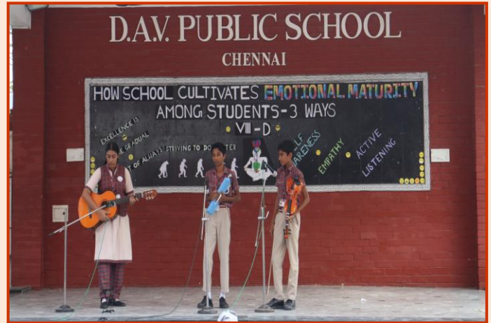
Instrumental Quiz – Various Emotions