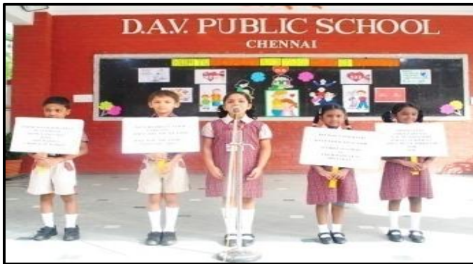
We are blessed to have such loving Parents