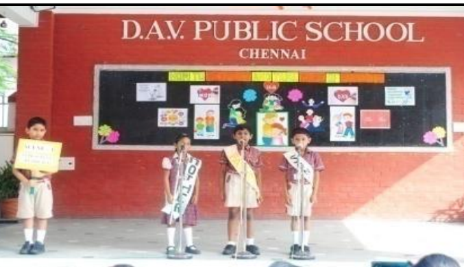
Words of Love and Affection being showered on their Parents