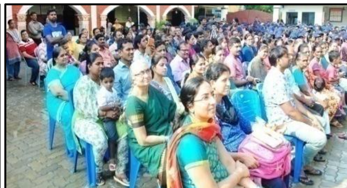
Parents beaming with pride after watching their ward's Performance