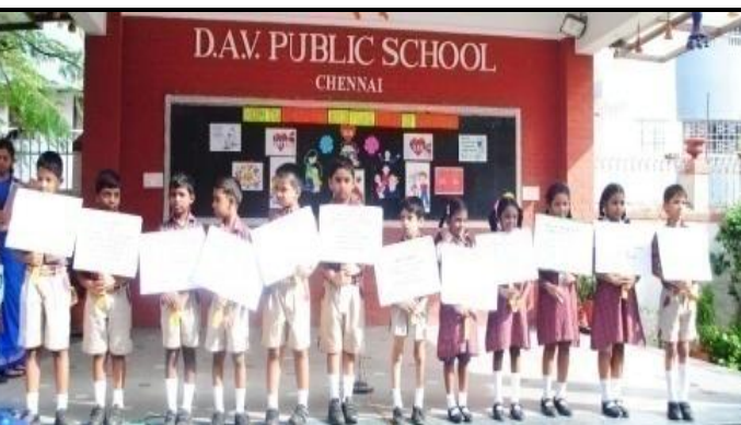
A Placard Depicting Parent's Love and Care