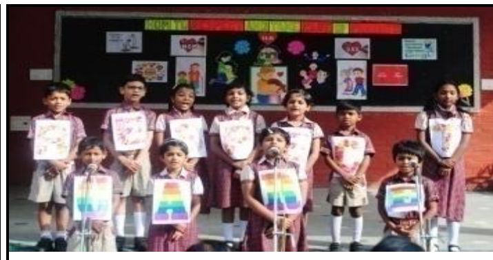
Seeing Parents as their Saviour - Song