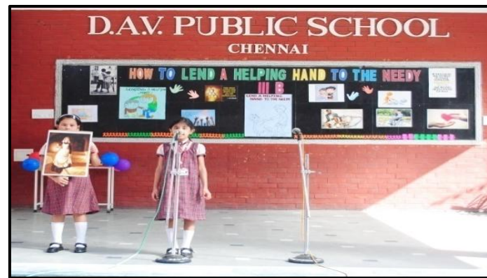
The Lady with the Lamp – A Soul for the Needy