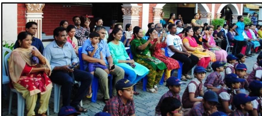
A Visual Treat to the Parents