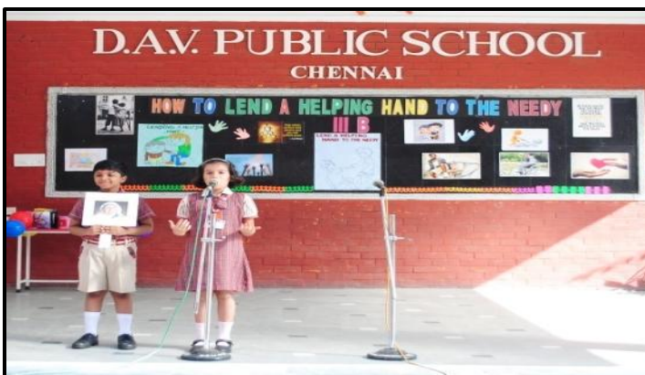
Mother Teresa – Messiah of the Poor