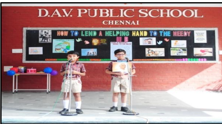
Baba Amte devoted his life for rehabilitating and empowering leprosy patients