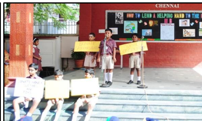
We vow to help our brethren in need