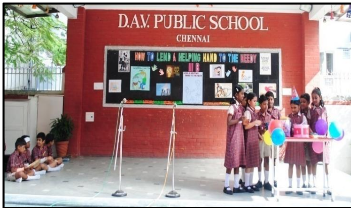
Don't waste Food – Share it with the needy