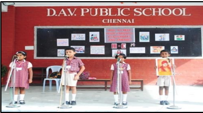
Lets Listen to Our Inner Voice