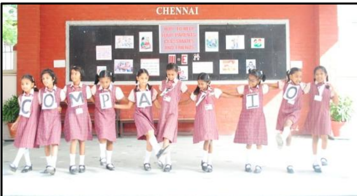
Significance of Compassion through Dance