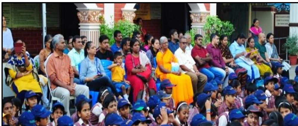
Parents in admiration of their ward's performance