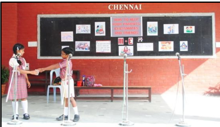
Mother of Mine – A Helping Hand