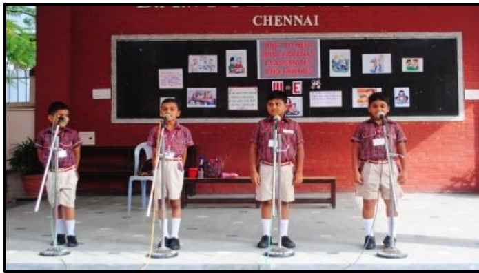
Compassion – A Friendly Conversation