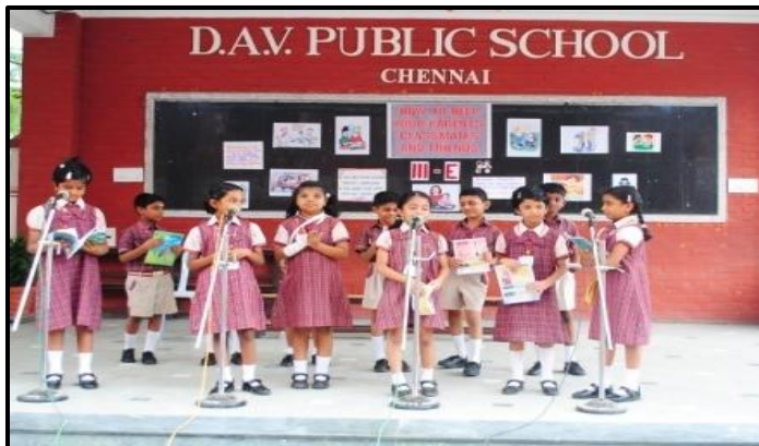
Compassion towards Peers in the Class