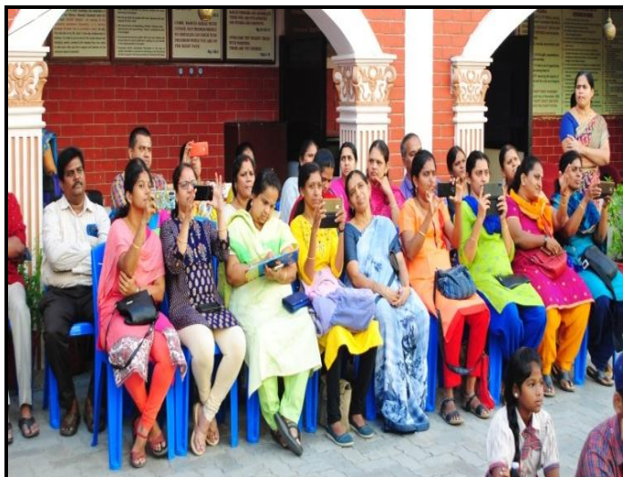
Enthralled parents witnessing the performance of their ward