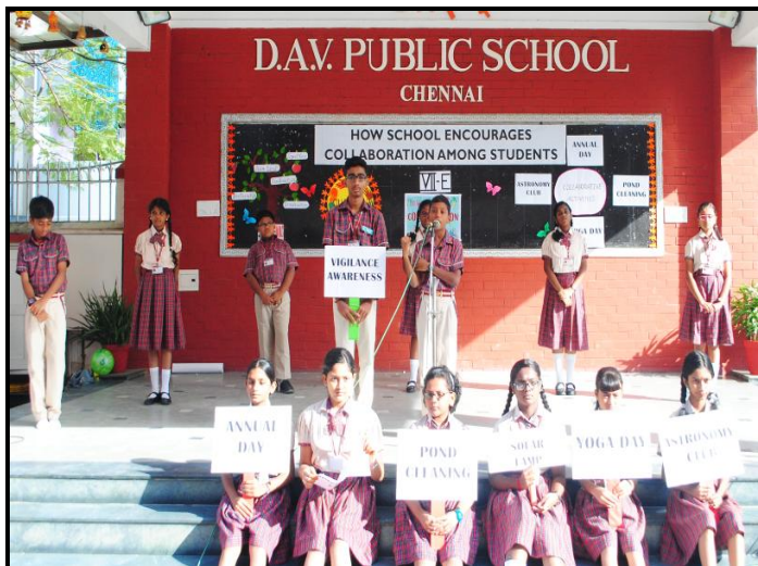
A Skit to show Collaboration in Real Life