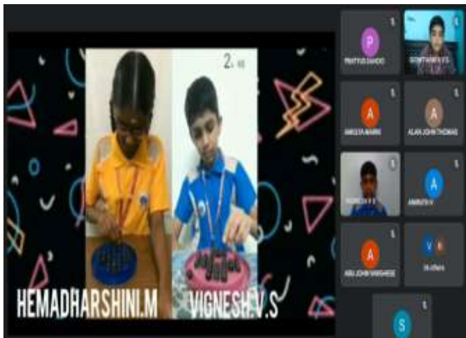
Highlights On Various Activities To Hone The Mathematical Adeptness