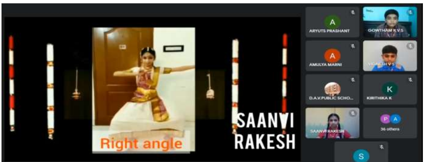
A Dance Treat – Throw Light on Mathematical Patterns