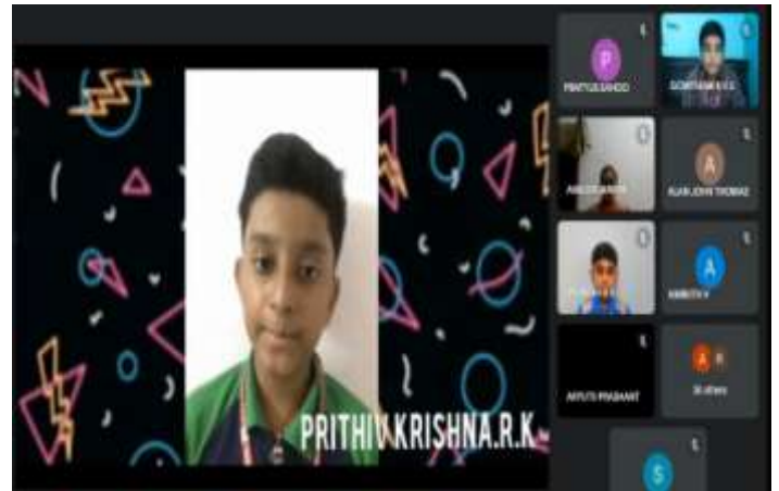
Close look into the topic Logical Mathematical Intelligence