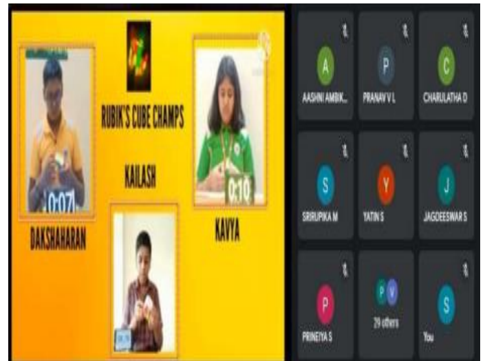
Rubik's Cube Champs- citius and fortius