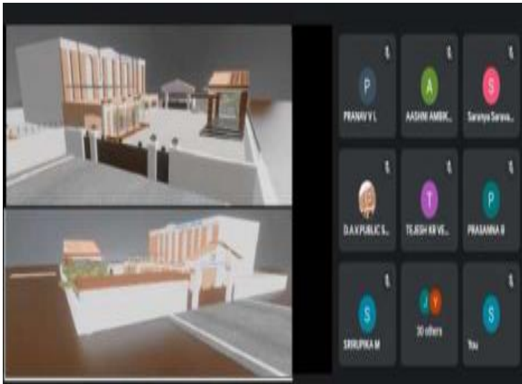
Virtual entry to School