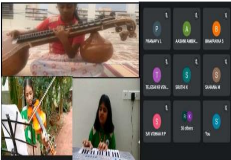
Amalgamation of music notes and harmony