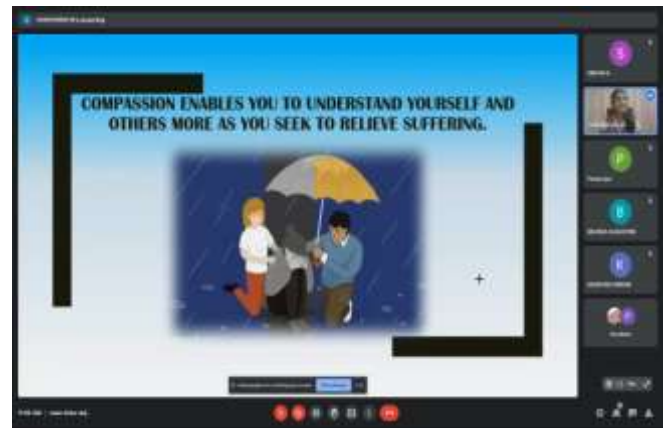
TALE OF BENEVOLENCE - Inspirational Acts of Kindness