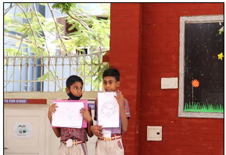
Artistic Fingers of V - E