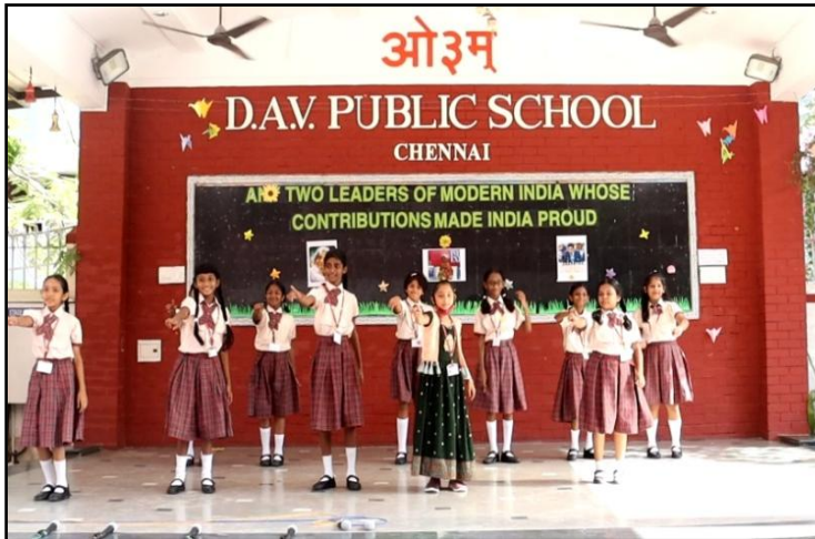
Alluring Tapping Toes of V - E