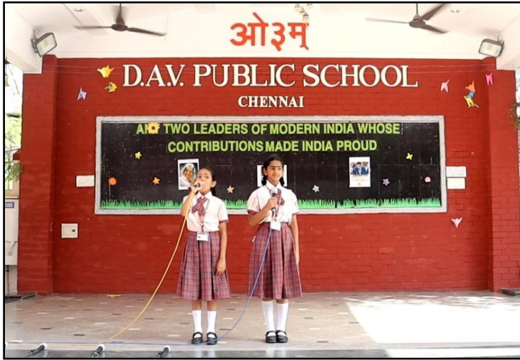
Gasconade by Masters of Ceremony