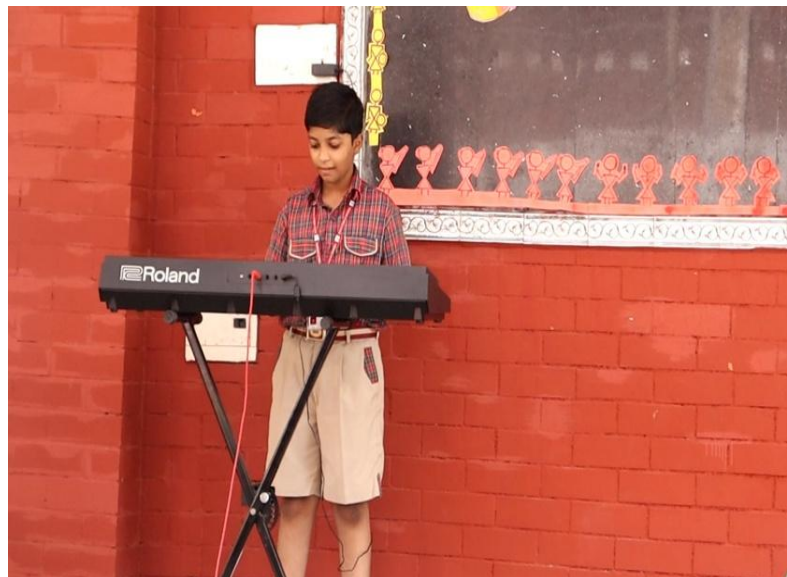
Ghetto Blaster Keyboardist