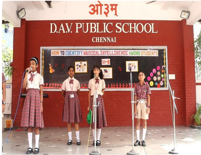
Musical Whiz - Kids