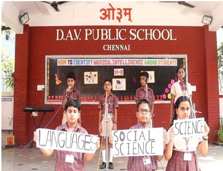
Docudrama on Musical Intelligence