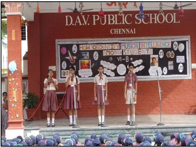
Students Elucidate on the grandeur of “Musical Intelligence”

TOPIC : HOW TO IDENTIFY MUSICAL INTELLIGENCE AMONG STUDENTS (MUSIC SMART) – ROLE OF MUSIC IN OUR LIVES. ANECDOTES FROM THE LIFE OF ANY TWO PROMINENT INDIAN MUSICIANS.