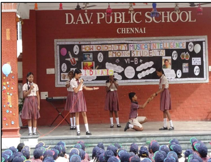
A Skit on – “World Renowned Musicians”