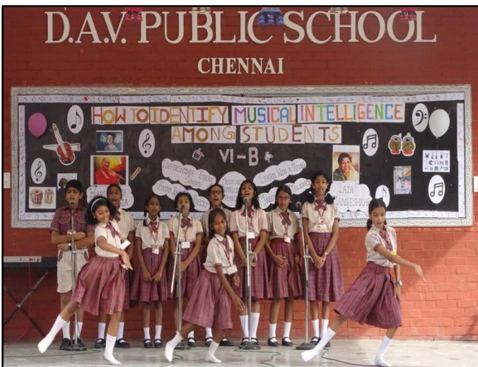
A Myriad Medley of Dance and Song