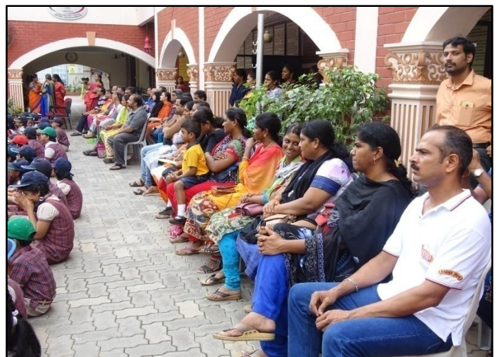
Proud Parents enthralled by their wards' performance