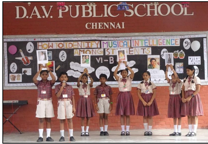
“Musicians are the dreamers of dreams” Speech on the Famous Musicians – Hariprasad Chaurasia and Lata Mangeshkar