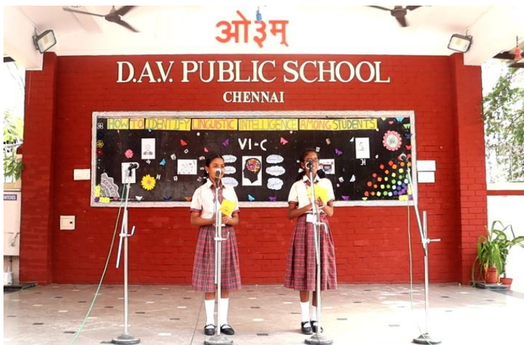
Word Puzzle - Riddles on Vocabulary