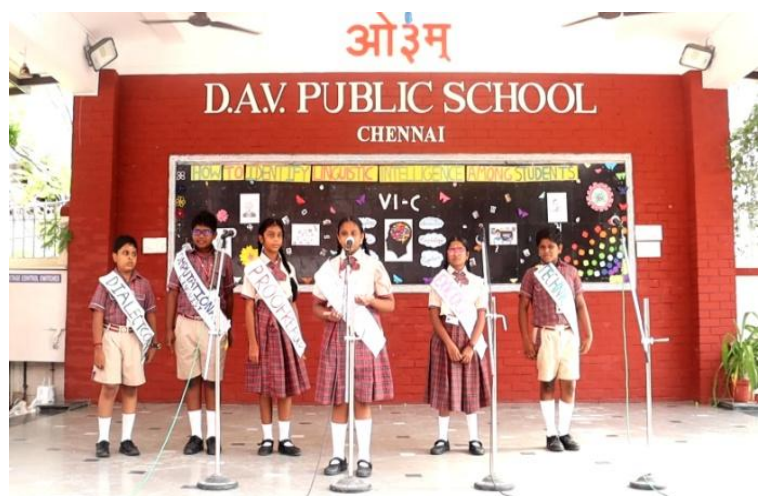
Docudrama – Linguistic professions