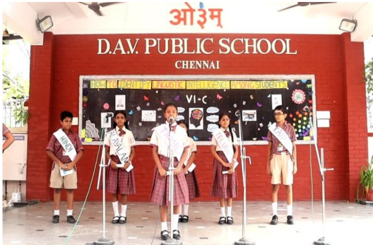
Bhasha Sangam – Symphony of Languages