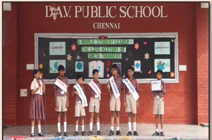
Collective Measure to Care Our Mother Earth