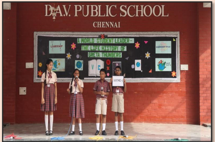
Life History of Greta Thunberg