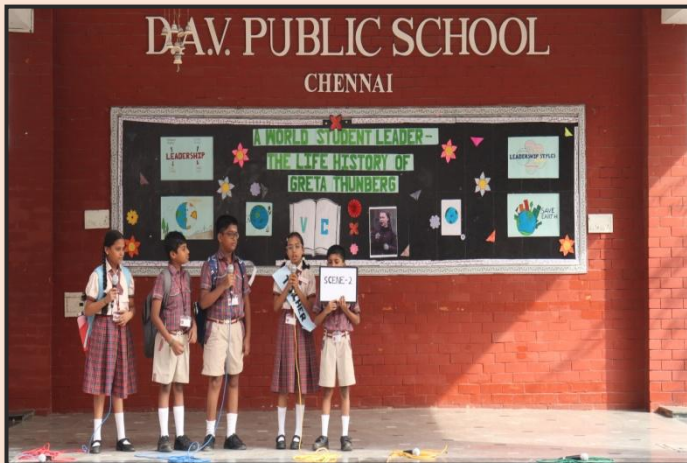
Significance of Caring Environment