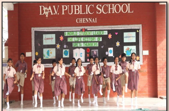
Lead with Passion, Dance with Co-ordination