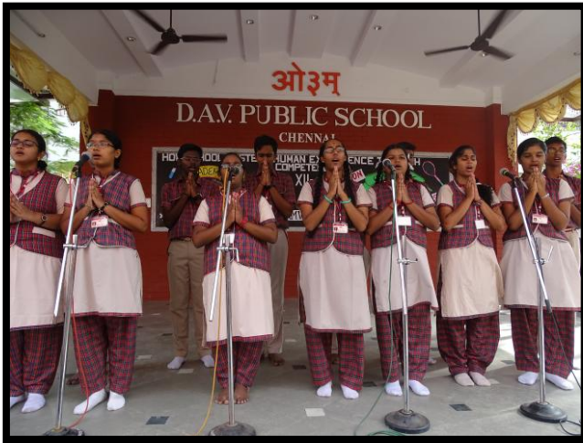
Fervent Morning Prayers