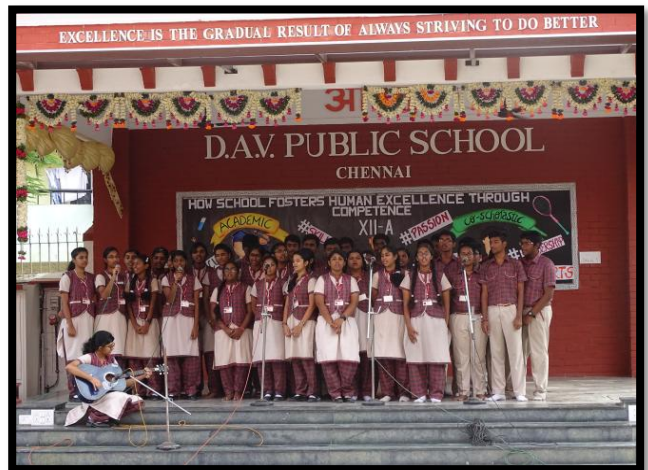
Strength of Team Work- A Song in Unison