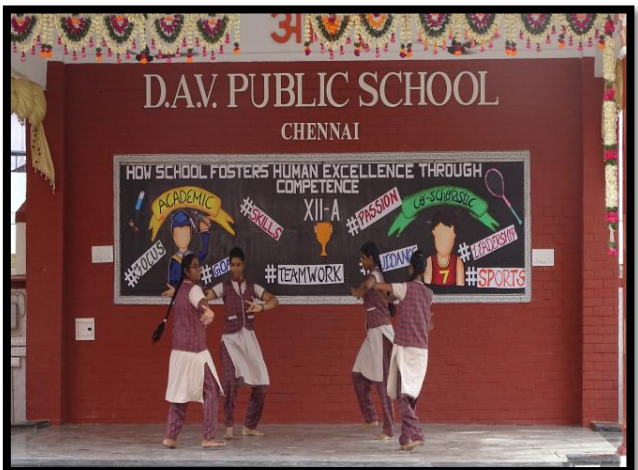
Harnessing Talent for Triumph