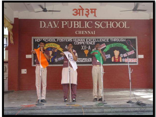
A Spark of Patriotism during the National Pledge