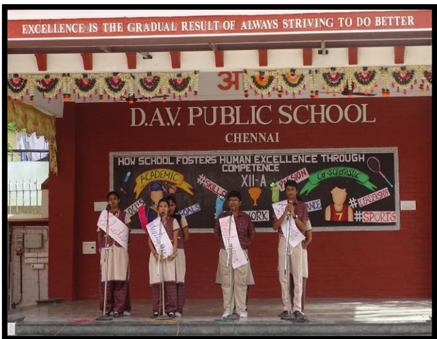
Four Fold of Academic Competence - A Talk show with Puppets