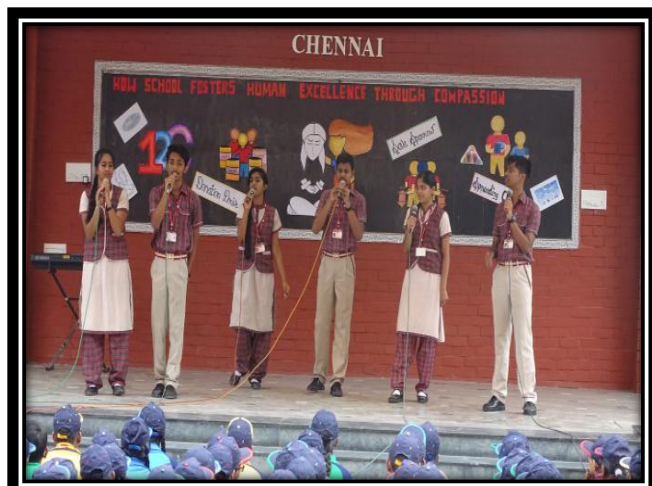
Music – The Strongest Magic