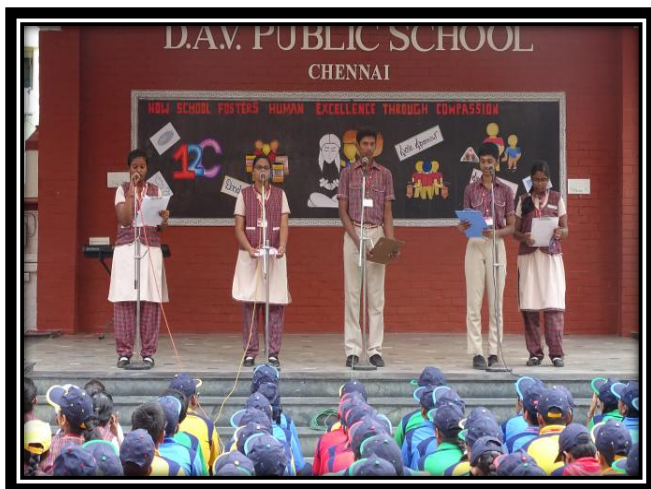
Around the World in 3 Minutes