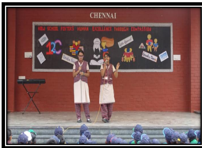
Words of Compassion