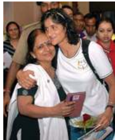
Sunita Williams with her relatives