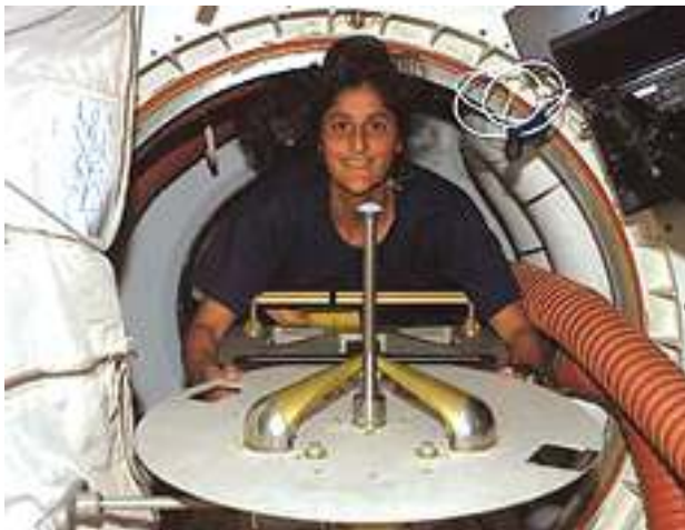
Sunita Williams coming out of spaceship

As Sunita Williams ended her space journey in United States, her relatives back home in Gujarat could not stop their tears of joy. 'She has landed safely by the grace of God. It is a moment of great joy for all of us,' said Sunita's uncle. Her relatives came out on the streets and danced till daybreak, bursting crackers and beating drums!