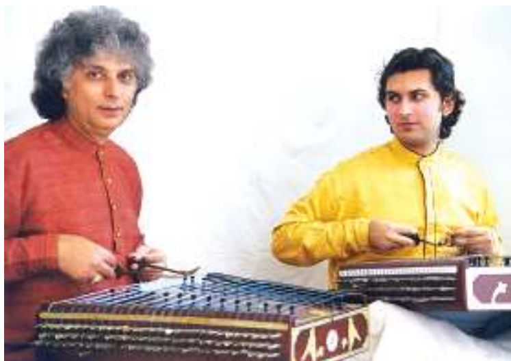
Pt. Shiv Kumar Sharma and his son Rahul Sharma

In some families, the food habits or style of dressing of some of the members are similar. Some members of a family may not like some dish or the whole family may be fond of kheer (rice pudding). In the same manner, many children follow the occupations of their parents or relatives like the son/daughter of a sports person wants to follow the same sport. The children of singers, artists, actors, builders, goldsmiths or doctors may follow the footsteps of their parents or they may want to take up some other work.