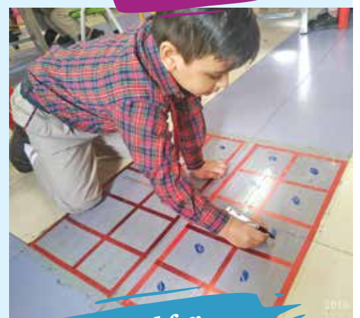
Equipped for future challenges