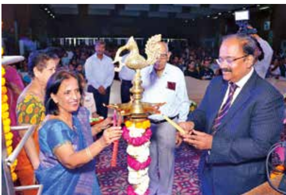
The programme commenced with the lighting of the lamp accompanied by a Classical Dance Recital on sacred mantras.