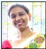
Preetha Sasidharan Secondary Section

I like the town most on rainy nights When everything is damp and wet , When the whole town has Magic lights Streets of shining jet, And bright fires ignite !