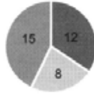
(b) ■ 2000 ■ 2020 ■ 2021