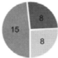
(a) ■ 2000 ■ 2020 ■ 2021

iv. Select the chart that appropriately represents the trend of viewer receptiveness on online content pages or channels. Paragraph 2. 1