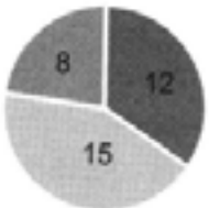
(c) ■ 2000 ■ 2020 ■ 2021